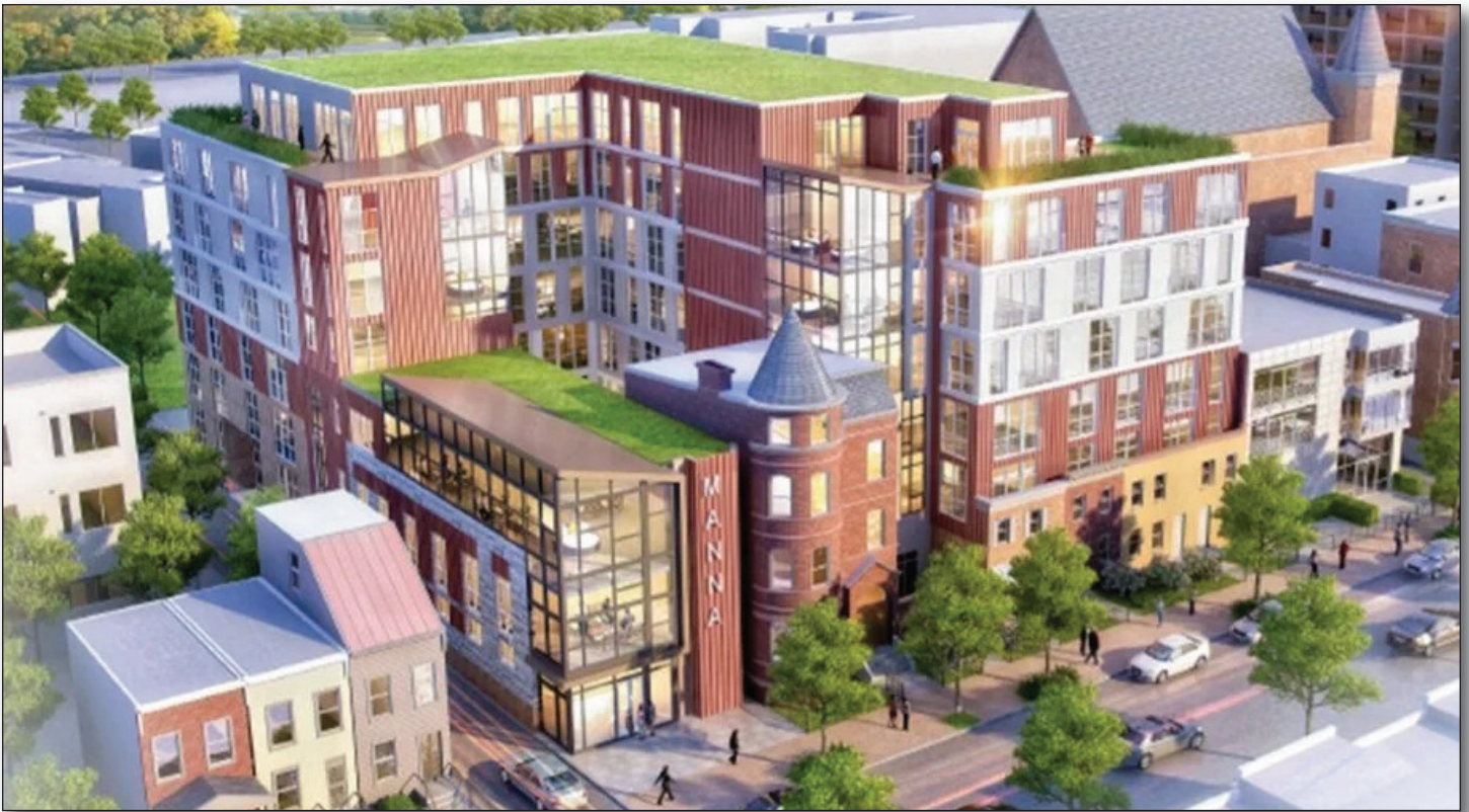
New Community S-St Project