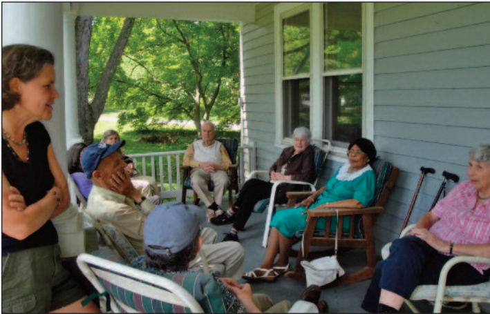
Farmhouse Porch gathering