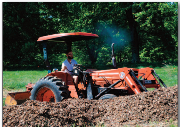
A Permaculture workday . . .