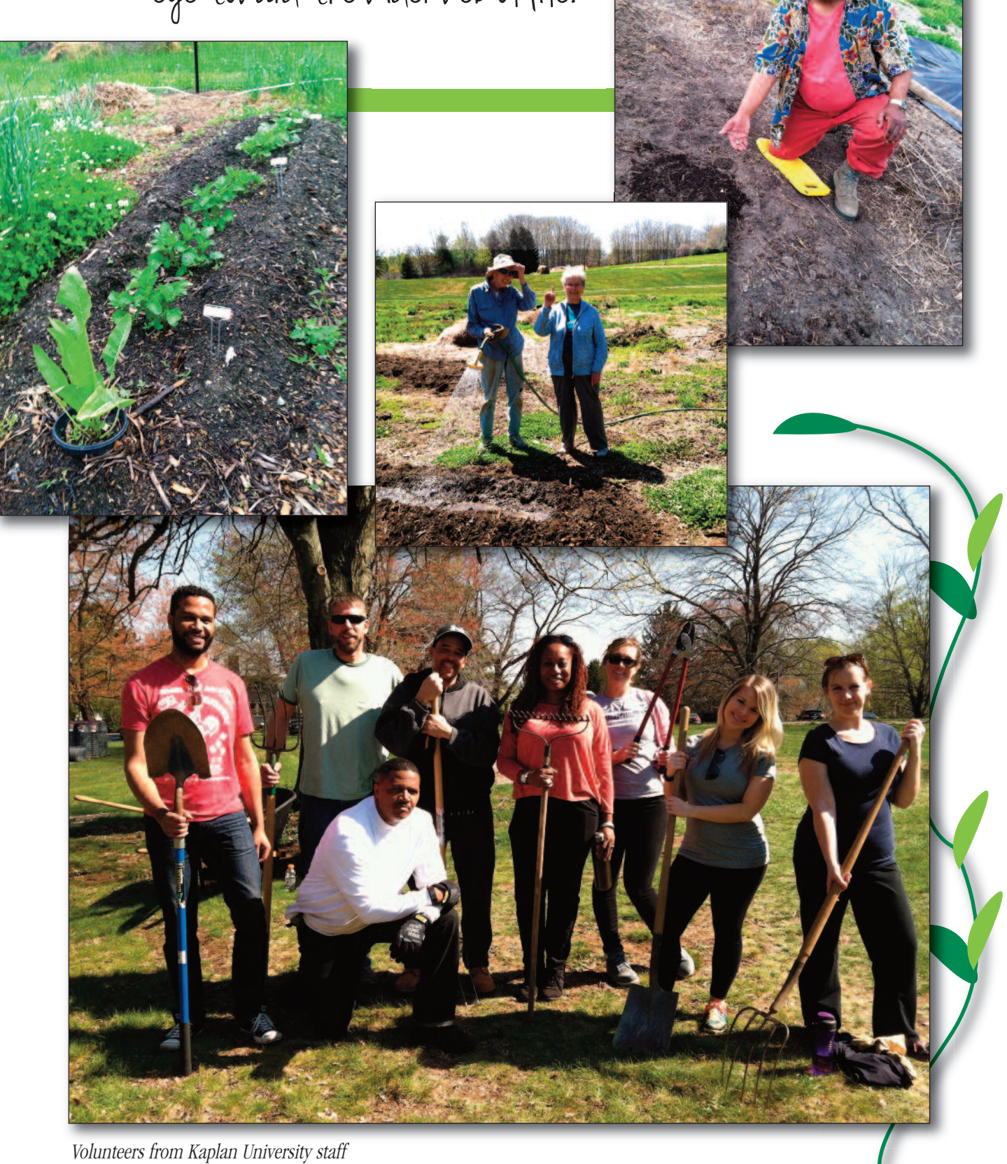
Durhope is to tend the ground with an eye toward the wider web of life.